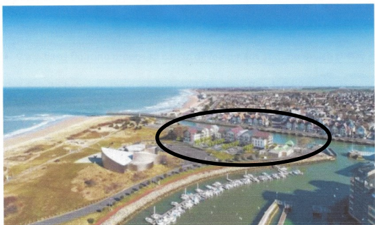
The site of the proposed condo development at Juno Beach, with the Juno Beach Centre museum visible near the bottom-left of the frame.