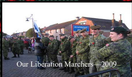
Our Liberation Marchers—2009