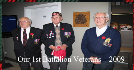
Our 1st Battalion Veterans—2009