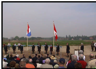
2005—Zutphen (Leesten), The Netherlands