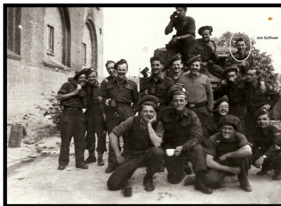
1945—VE Day—Emden, Germany