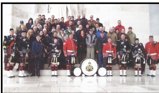
The Tour Group at The Vimy Memorial