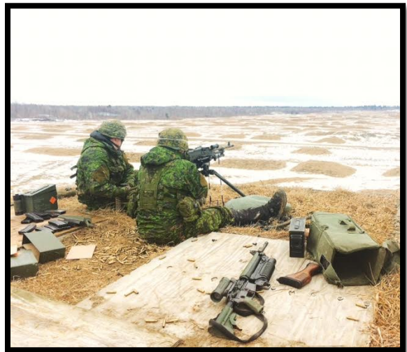
A member of 1 Platoon, A Coy, SD&G Highlanders prepares to fire the C6 General Purpose Machine Gun (GPMG) on the Sustained Fire kit as his number 2 watches where the rounds land

With smaller numbers than we've seen in the past, training has proven difficult. Short on hands but full on work, we've truly put into practice the idea of teamwork; members at every level must fill their assigned role and then some. Assaulting a two-story house-sized building may seem simple on the surface, but you quickly find that sheer manpower is required to do so effectively, requiring on-the-fly problem solving and adaptation.