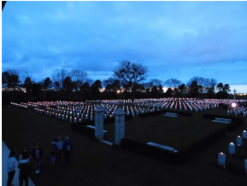
Holten Canadian War Cemetery