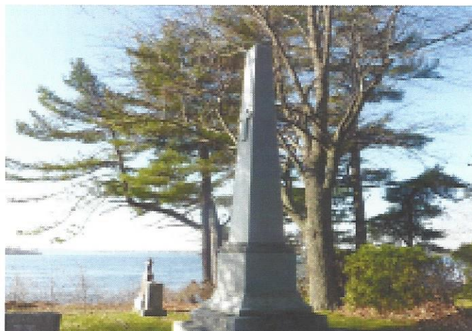
The Bergin Monument – Precious Blood Cemetery